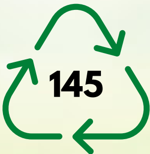
TOTAL KG OF PLASTIC SAVED