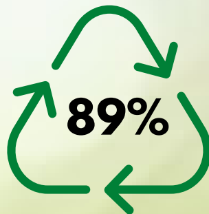
MATERIALS USED INTO NEW PRODUCTS