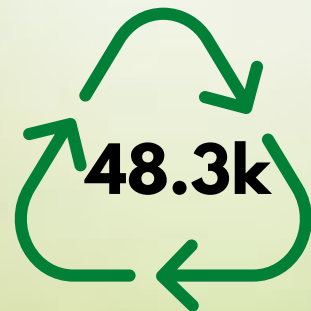
NO OF EQUIVALENT PLASTIC CUPS**

0.024 Tonnes AMOUNT OF EQUIVALENT CO2 SAVED